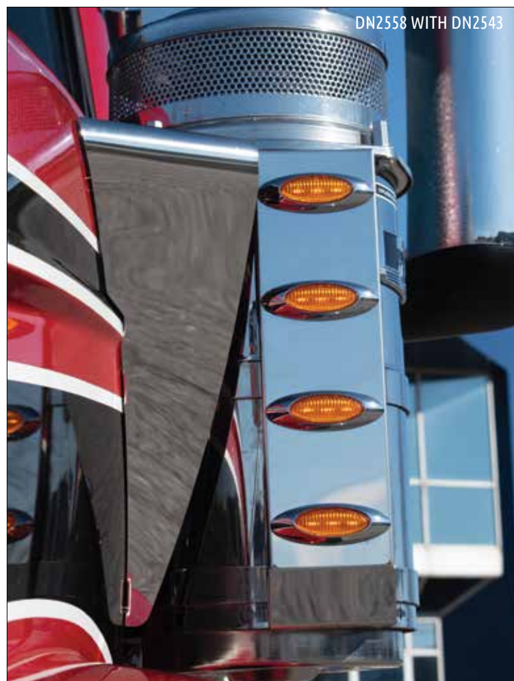
DN2558 WITH DN2543