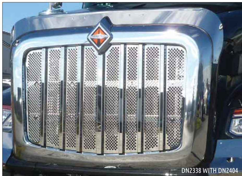
DN2338 WITH DN2404