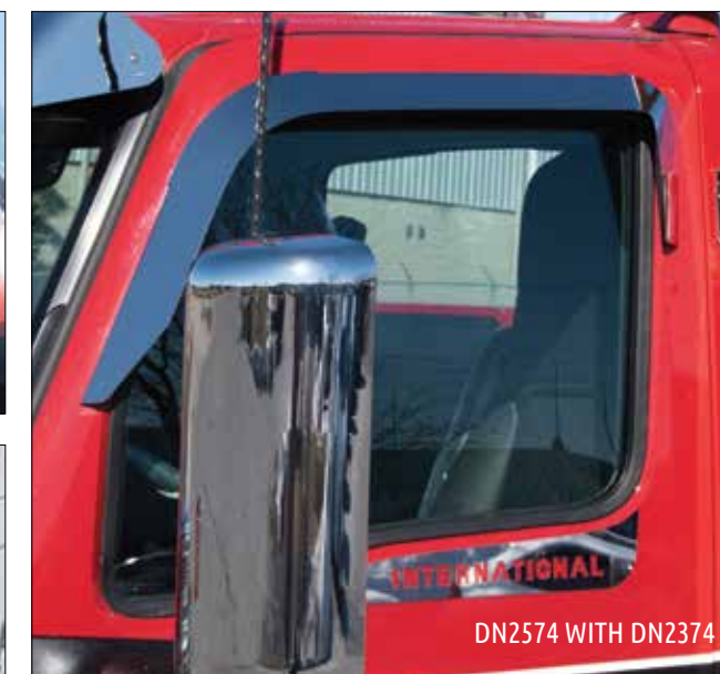
DN2574 WITH DN2374