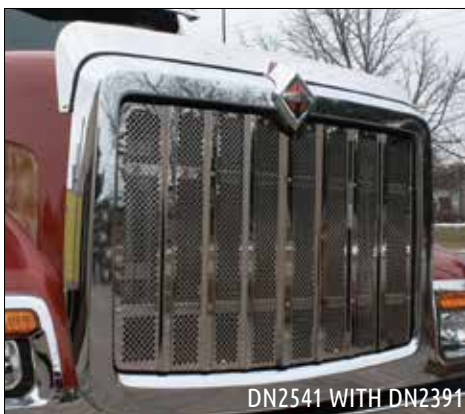
DN2541 WITH DN2391