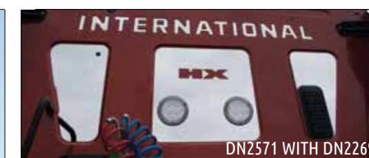
DN2571 WITH DN2269